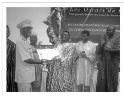
GRAND OSCAR 2009 OF DEVELOPMENT