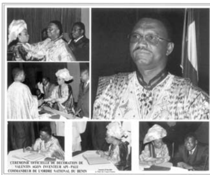
COMMANDER OF BENIN NATIONAL ORDER IN 2009