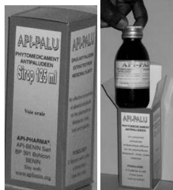
ALL THESE AWARDS FOR PATENTED INVENTION API PALU: THE SOLUTION AGAINST AFRICAN malaria

API-PALU IS MORE THAN A DRUG, API-PALU IS A TOOL OF DEVELOPMENT