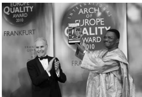
EUROPE ARC PRIZES IN GERMANY 2010