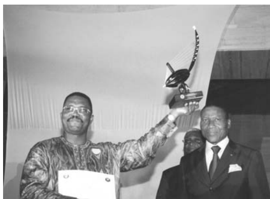
ECOWAS CONTRACTOR INNOVATIVE LEADER PRIZE IN 2010