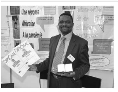
TWO GOLD MEDALS IN 2009 IN SWITZERLAND